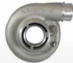
Compressor Cover SX-E Style

See page 37 for: Speed Sensor, Turbine Gaskets & V-Bands, Oil Drain Gasket & Fitting, Actuators & Brackets